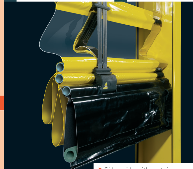
> Side guide with curtain