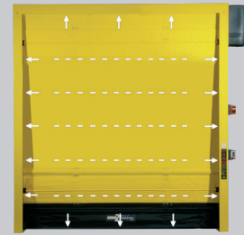
> Distribution wind load on door

Even if the door is hit and a stiffener would bend, the folding door will continue to work without interrupting the production flow.