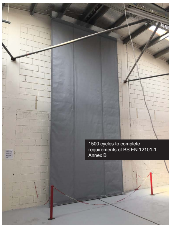
1500 cycles to complete requirements of BS EN 12101-1 Annex B

Kent Automatic Smoke Curtains enable the movement of smoke through a building in the event of a fire by channeling smoke to smoke extraction points or creating reservoirs to slow its spread. They remain virtually invisible in their retracted position within the compact headbox in its retracted position within the compact head box. When signalled by a local detector or alarm, they descend to the operational level above the floor.