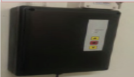
Optional Autologic Controller