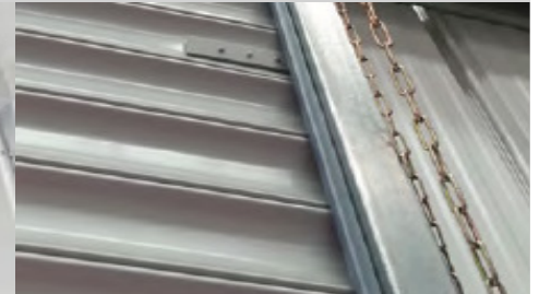
Silenced Guides with PVC Wear Strips

43a Hobill Ave, Wiri, Auckland 2104, New Zealand ☎ + 64 9 273 4970 sales@acedoors.co.nz