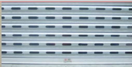
Optional Vented Slats