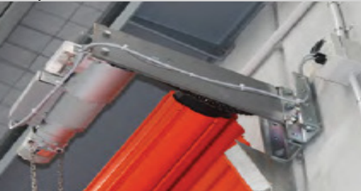
Dual Brake Motor with Auto-engage handchain