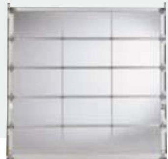
(AlumaView STANDARD model shown)