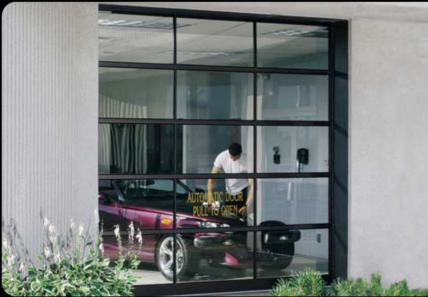
AlumaView STANDARD, bronze-anodized