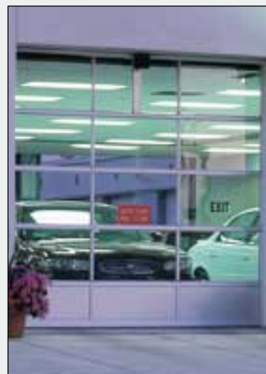
AlumaView STANDARD, clear-anodized, with bottom section aluminum panels

This benchmark product provides Raynor reliability and durability to meet or exceed the requirements of daily use. With 1 3 / 4 " thick door sections and streamlined rail construction, this door is engineered for lasting beauty and durability.