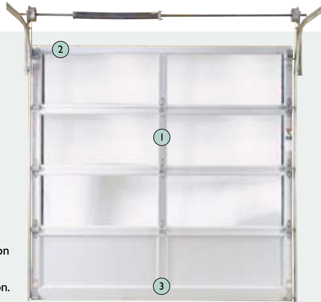
(AlumaView OPTIMA model shown)

AlumaView doors help you reduce energy costs with a U-shaped, vinyl bottom weatherseal secured by a sturdy aluminum retainer.